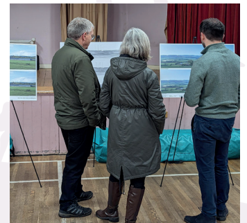
Consultation event at Dunning Village Hall

We were delighted with the range of feedback we received. This will be extremely helpful as we progress our wind farm development. A summary of these is highlighted below.