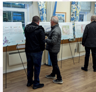
Consultation event at Carnbo Community Hall

Galileo held two public consultation events in November 2023. The first took place in Carnbo on 14th November, while the other was held in Dunning the following day.